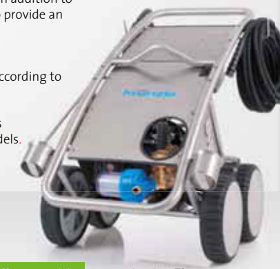
L 30/200 TS