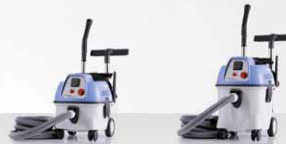
Ventos 20 E/L