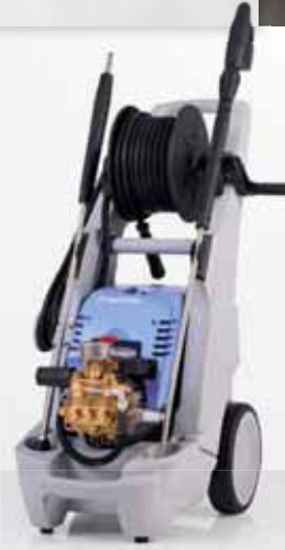
bully 1180 TS T