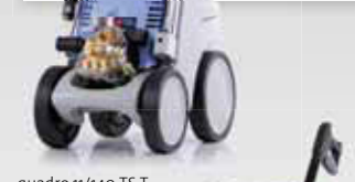
quadro 11/140 TS T