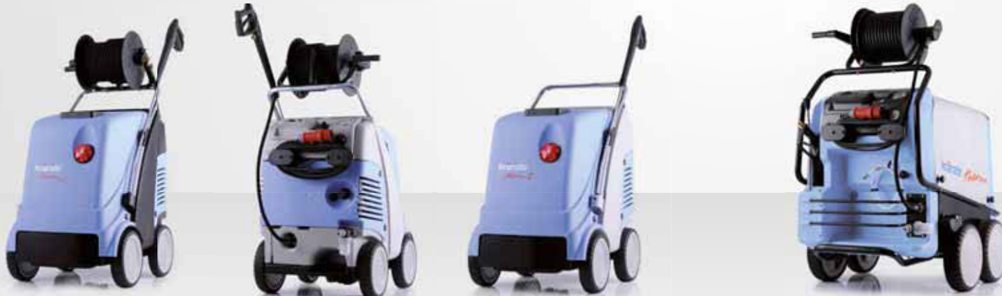
therm CA 11/130 T therm CA 12/150 T