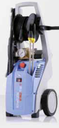
K 2160 TS T

Designed, of course, with the roto-mold trolley, and with integrated hose drum according to model and dirt killer and vario jet lance as a standard including practical neat arrangement for efficient handling during operation.