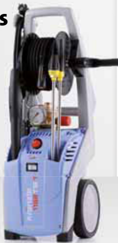
K 1152 TS T

Due to its integrated neat arrangement system everything is under control at any time.