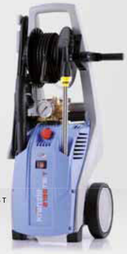
K 2195 TS T