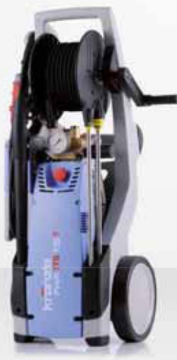
Profi 175 TS T