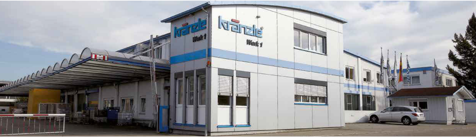
Fig. Production factory 1, Illertissen