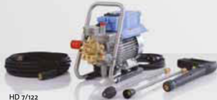
HD 7/122 HD 10/122 with Dirtkiller