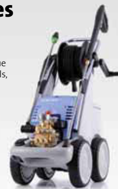
quadro 799 TS T